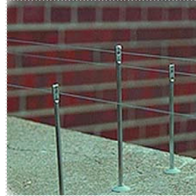
Repellents such as bird spikes (LEFT) and piano wire (RIGHT) can help keep pest birds at bay.